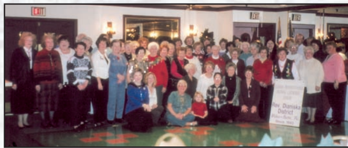
Members and guests at the District's Christmas party.