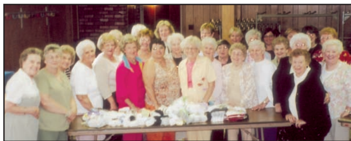
Rev. Dianiska District members with a whole table full of donated socks.