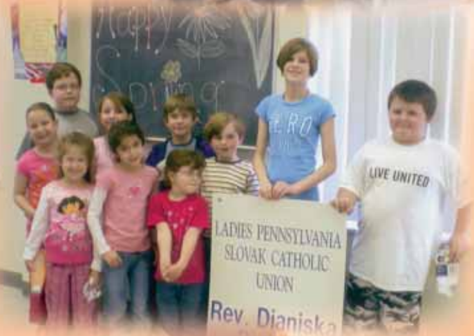
Our proud young members who volunteered at The Laurels Skilled Nursing and Rehabilitation Center.