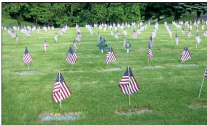
Flags decorate the graves of fallen military in Pittsburgh's Highwood Cemetery.