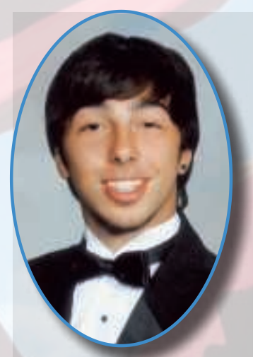
Whitehall, PA Freshman Kutztown University Kutztown, PA MEMBER OF BRANCH 38 Whitehall, PA