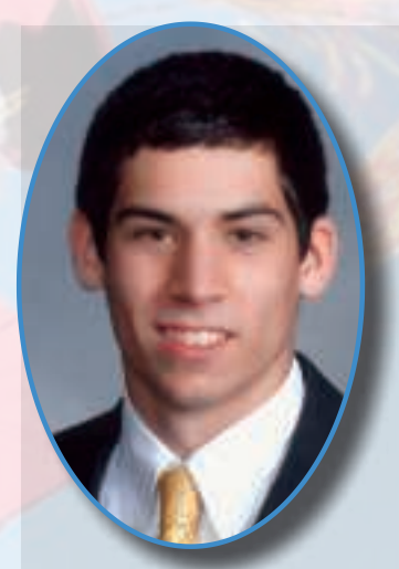
Bethlehem, PA Freshman Moravian College Bethlehem, PA MEMBER OF BRANCH 130 Bethlehem, PA