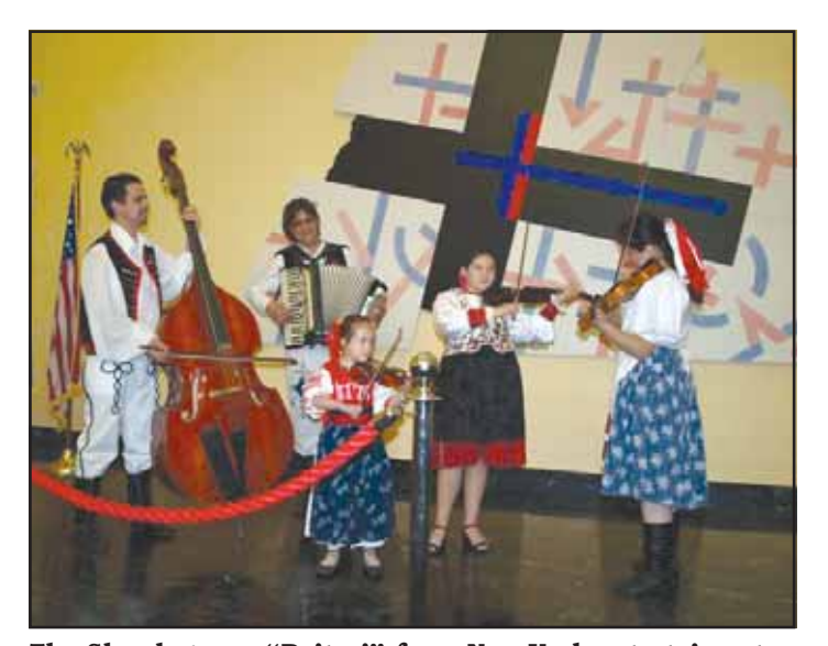
The Slovak group "Pajtasi" from New York entertains at the Slovak Embassy as part of the European Union's 2010 Open House.

This was the fourth time that the 27 EU Member States and the European Union Delegation have jointly organized an EU Open House to provide the general public a rare look inside their embassies. The EU Open House, the single biggest celebration of the EU in the world, demonstrated the EU's motto of "unity through diversity" by showcasing the range and richness of EU countries.