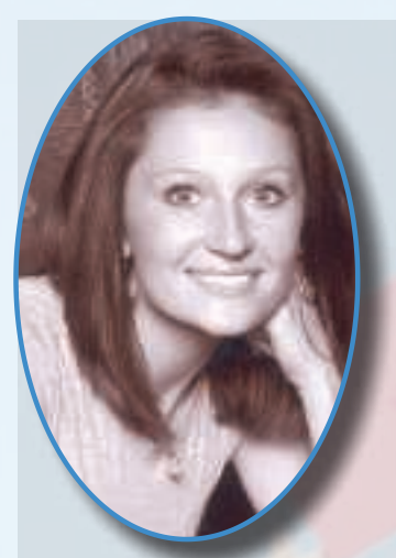
Quakertown, PA Freshman Villanova University Villanova, PA MEMBER OF BRANCH 156 Coaldale, PA