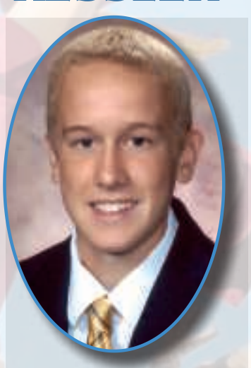
Myerstown, PA Freshman University of Pittsburgh Pittsburgh, PA MEMBER OF BRANCH 130 Bethlehem, PA