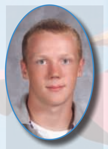
Derry, PA Freshman California University of PA California, PA MEMBER OF BRANCH 42 Pittsburgh, PA