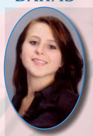
Dupont, PA Freshman Drexel University Philadelphia, PA MEMBER OF BRANCH 7 Exeter, PA