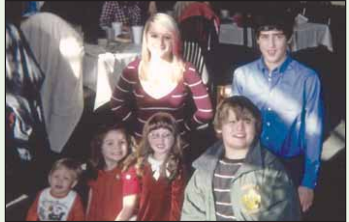
Pictured are some of the young members who attended Branch 52's Christmas party.

All attendees had a memorable time and are looking forward with anticipation to another great LPSCU year.