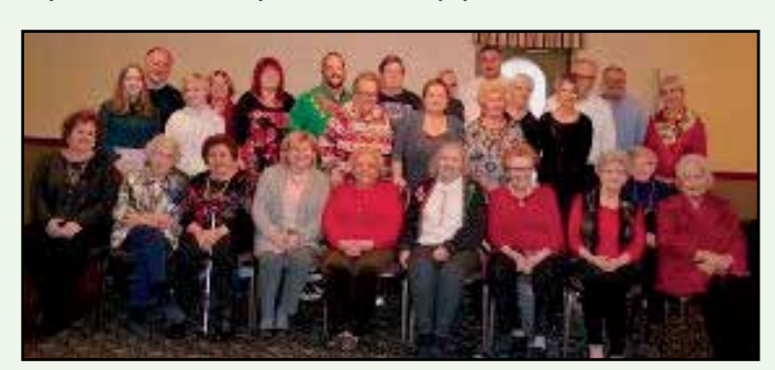
Members and guests who attended the Pittsburgh District's Christmas party.

We were blessed with a beautiful day to initiate the holiday season and everyone had an enjoyable time.