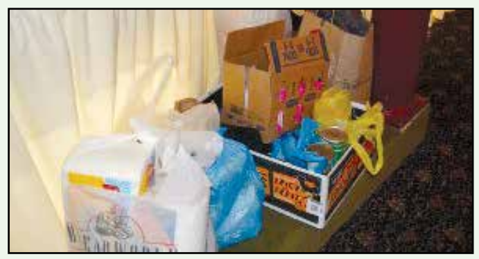
Some of the items generously donated by members.