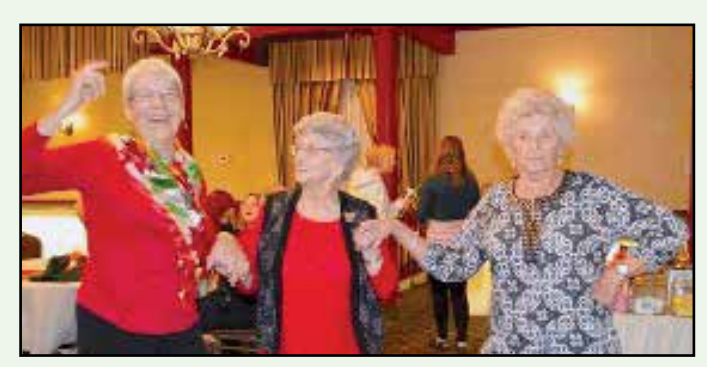
Mikey Dee's lively tunes got some of the ladies up on the dance floor.