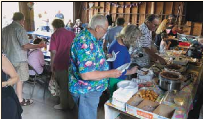
Members and guests enjoy lots of delicious food and goodies.