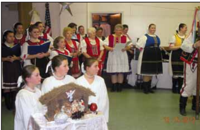
The Pittsburgh Slovaks entertain.