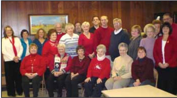
Attendees at the Msgr. Beeda District Christmas party gather for a picture.

The Msgr. Beeda District would like to wish all LPSCU members and their families a very Merry Christmas and a Happy and Healthy New Year!