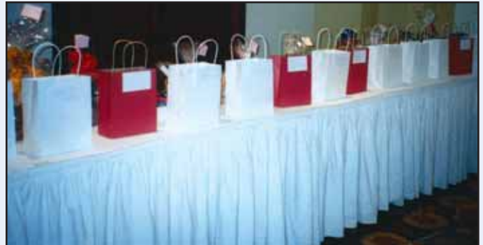
A display of themed gift baskets which were raffled as a Matching Fund project to benefit the Allentown Diocesan Soup Kitchen.