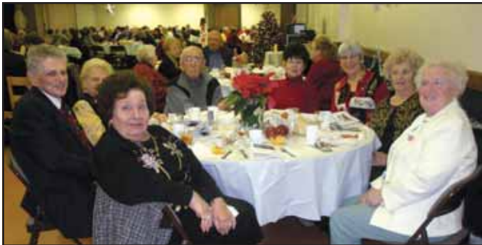
Parishioners and guests enjoy the Prince of Peace Slovak vilija.

Prince of Peace Parish, South Side, Pittsburgh, Pennsylvania, celebrated its annual Slovak Vilija and Jaslickare Program on December 15, 2012. Among the hundreds attending the traditional Christmas Eve Slovak dinner were Pittsburgh District members and their guests. The Pittsburgh Slovaks presented a lovely tribute to this blessed and joyous holy season.