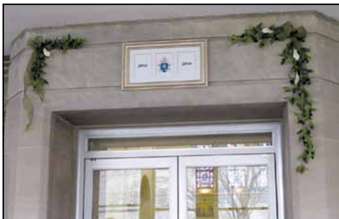
The Doors of Mercy through which pilgrims pass to enter the Basilica of Saints Cyril and Methodius.