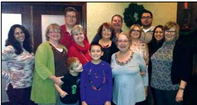
Members enjoying the Illiana holiday social.