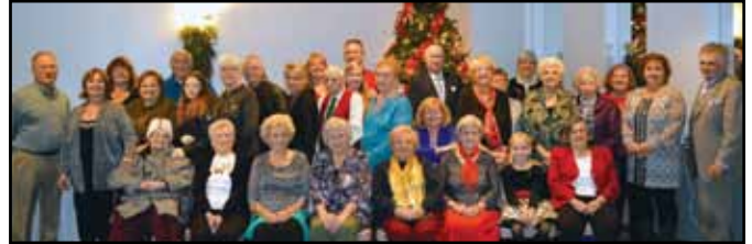
Members and guests who attended the Pittsburgh District's Christmas party.