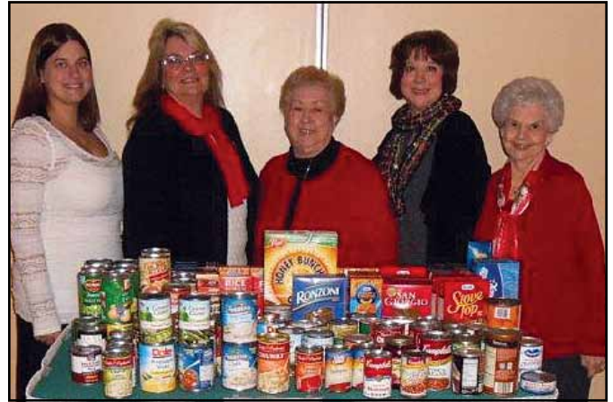
Canned goods donated by members and guests for the St. Vincent dePaul Kitchen.

Members of the Reverend Dianiska District exchanged Christmas greetings with one another and wished everyone at the LPSCU a healthy and happy New Year!