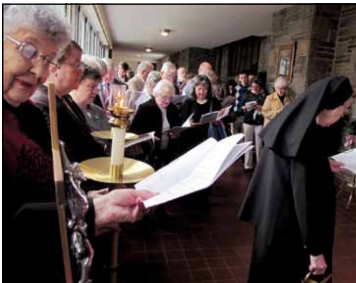
More than one hundred pilgrims attended the Liturgy opening the Year of Mercy at the Basilica of Saints Cyril and Methodius on December 13, 2015.

The Basilica of Saints Cyril and Methodius was named after the spiritual patrons of the Sisters of Saints Cyril and Methodius: the missionary brothers Cyril and Methodius. The Basilica is the daily place of prayer for the Sisters of Saints Cyril and Methodius, and is also the site of ecumenical gatherings, pilgrimages, weekend and week-long retreats, and days of prayer, not only for the Sisters, but for the general public. During this Jubilee of Mercy Holy Year, the Basilica will also house special Jubilee events, and welcome pilgrims throughout the year.