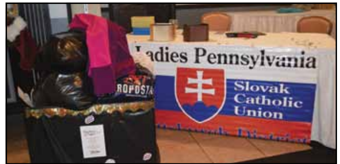
Coats and blankets donated for a local charity.