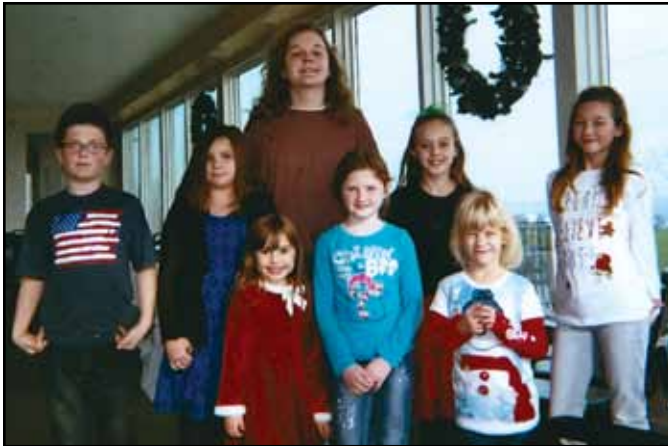
Pictured are some of the young members who attended Branch 52's Christmas party.

Everyone enjoyed a memorable time and Branch members are looking forward with anticipation to another great LPSCU year.