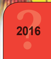
Who Will It Be?

Do you know a member who, through example and accomplishment, provides outstanding volunteer services?