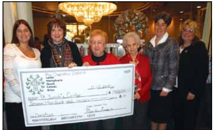
Check presentation to St. Joseph's Center.