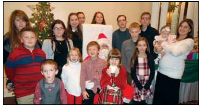
Young members are pictured with Santa.