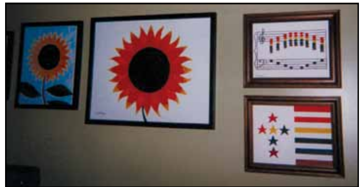
Some of Larry's colorful paintings.