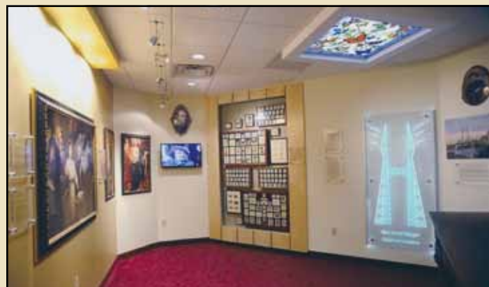
The Father Jozef Murgas Room at King's College on the Square, Wilkes-Barre, Pennsylvania.

The 34 x 72 inch glass panels placed on opposite sides of the room were artistically hand carved and enhanced with LED