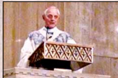
Archbishop Wuerl giving his homily.