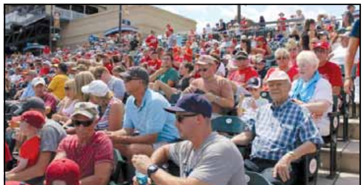
A group of Lehigh Valley Okres members who attended the ball game.