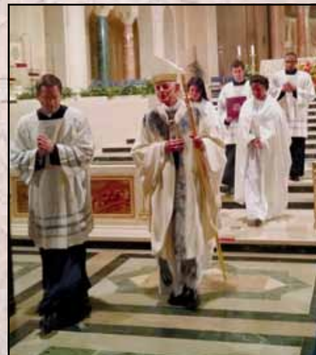
The recessional after the Mass.