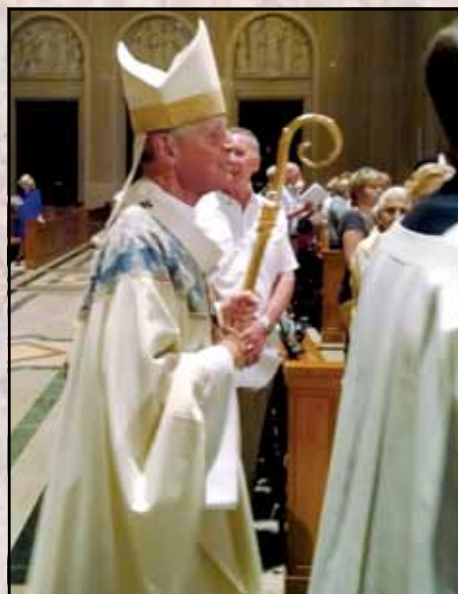
His Eminence Donald Cardinal Wuerl, Archbishop of Washington, D.C., in procession at the Liturgy.

To further etch this day in the history books, the First Catholic Slovak Union, in collaboration with the Slovak Catholic Federation, coordinated a day of pilgrimage. The day included a tour of the shrine that provided an opportunity for all to see the chair and altar that Pope Francis would use during his upcoming visit to Washington. Those wishing to attend Confession were able to do so – in English or Slovak! Mid-afternoon, the 50th Anniversary celebration com-