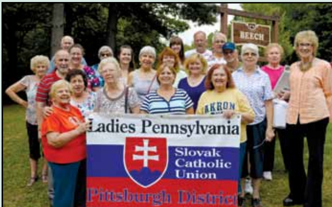
Pittsburgh District members who attended the annual summer picnic.