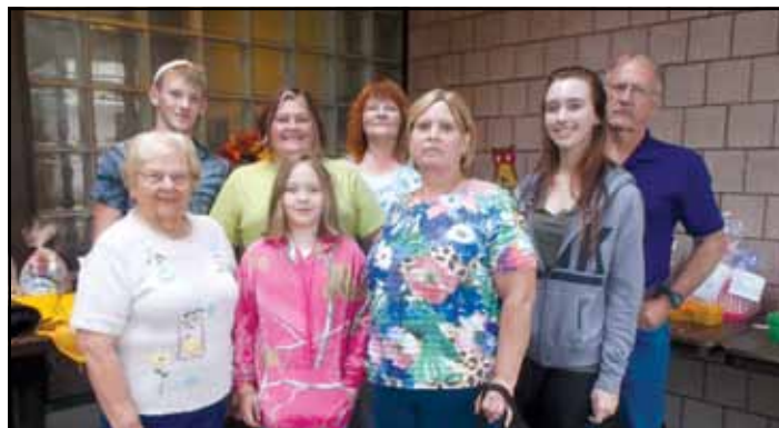
Pittsburgh District members who volunteered to "make a difference" for residents at Kane Nursing Home.

The most rewarding benefit of this event was helping to put smiles on the residents' faces. God bless the residents and the management of the Kane Nursing Home Centers. This was an enjoyable event for the Pittsburgh volunteers and hopefully it can be an ongoing partnership.