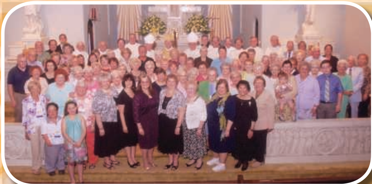
Clergy, LPSCU national officers, fraternalists, and guests are pictured in the Sanctuary of Saint Mary of the Mount Church, Mount Pocono, Pennsylvania.