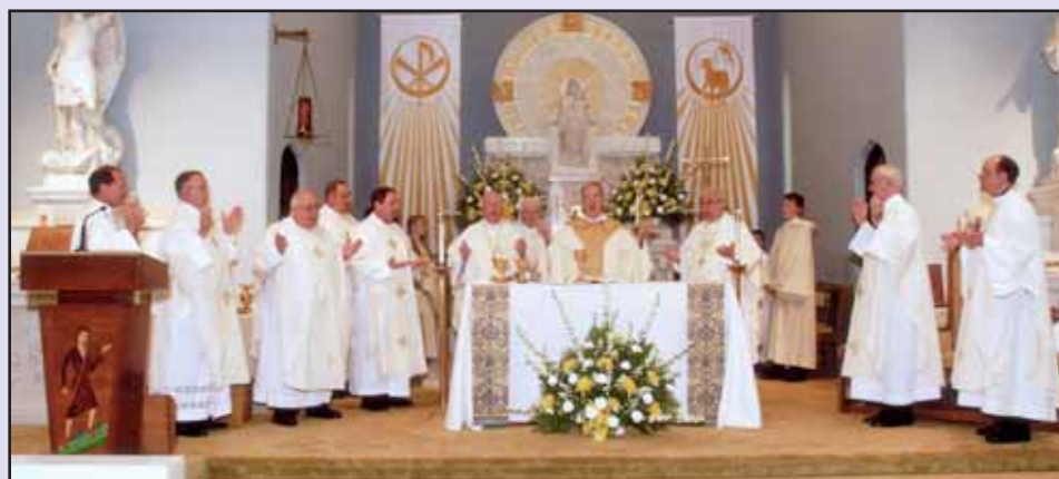
Celebrants and attending clergy celebrate at the Consecration of the Mass.