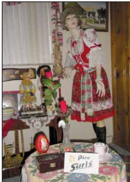
The manikin is covered with authentic Czechoslovakian embroidered clothes. Pictured in the background is a painting of the village where Arnold grew up in Saris.