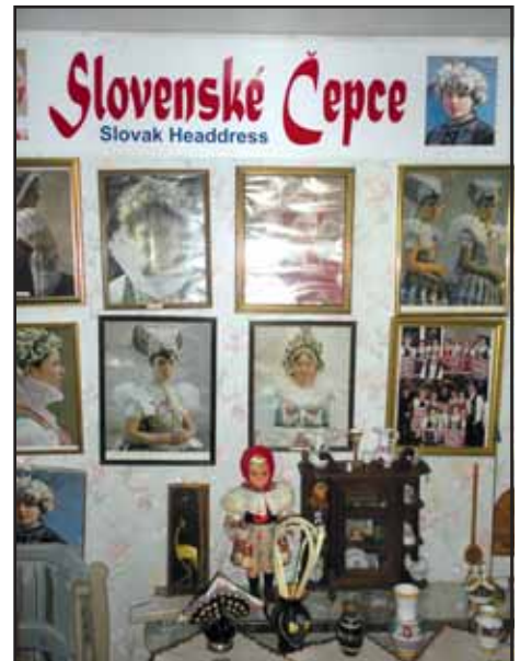
Slovenske cepce (hats) adorn another wall.