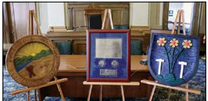
Two plaques and a framed metal plate will hang on the wall of Youngstown City Hall.