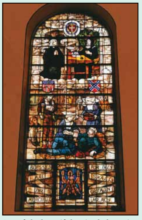
One of the beautiful stained glass windows in the church depicting Blessed Are the Merciful for They Shall Obtain Mercu.

By the time the Mass was scheduled to begin, the church was filled to capacity. The congregation was mostly families with children, reminding us of the World Meeting of Families that was held in Philadelphia during Pope Francis's recent visit.