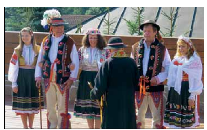
A mock traditional Slovak wedding ceremony, complete with reception, was a highlight of the 2015 Slovak Consular Tour.

If you are interested in a copy of the itinerary when it is completed, contact Joe at <u>itsenko@aol.com</u> or 412-956-6000.