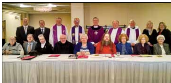
Pictured are the attendees at the Slovak Catholic Federation's spring meeting in Wilkes-Barre.