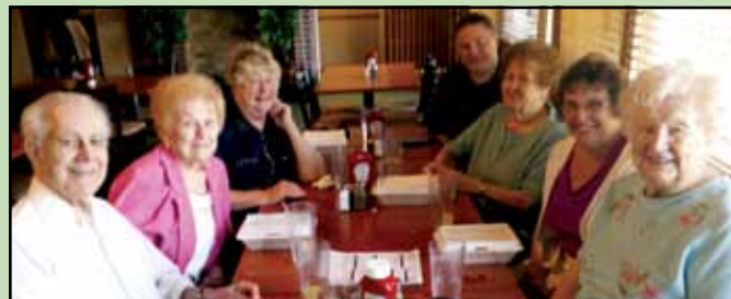
Pictured are some of the members who attended the Okres's May 17 meeting.

There being no further business, the meeting was adjourned.