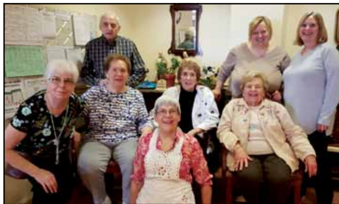
Pittsburgh District members who took part in the Join Hands Day event at the Little Sisters of the Poor facility.

The nursing and volunteer staff members were most helpful in making this event successful. This was indeed a very fulfilling and blessed day!