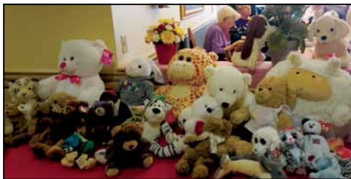
Pictured are a variety of plush toys donated by Pittsburgh District members for their Join Hands Day event.