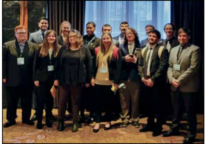
The entire delegation from King's College.