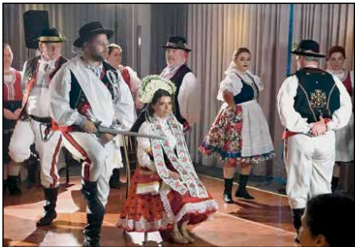
The bride takes part in a traditional Slovak wedding dance along with members of the Pittsburgh Slovaks.