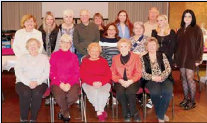
Pittsburgh District members pose for a group photo.