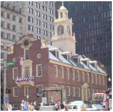
Old State House Boston, Massachusetts

Today, the event is commemorated every year with a Fourth of July reading of the Declaration from the Old State House balcony - but no bonfire.