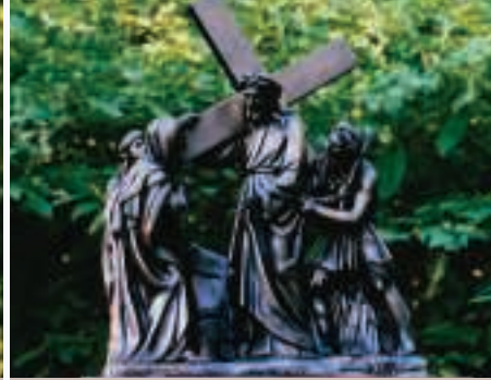
FOURTH STATION Jesus meets his sorrowful mother