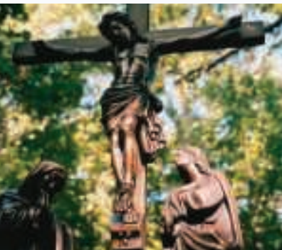
TWELFTH STATION Jesus is raised up on the cross and dies