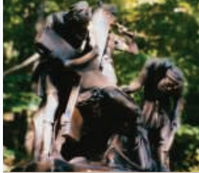
THIRD STATION Jesus falls the first time