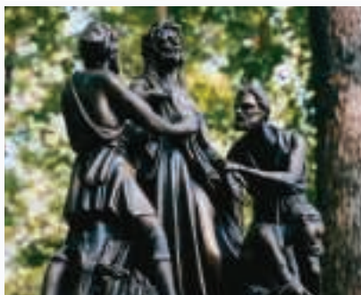
TENTH STATION Jesus is stripped of his garments