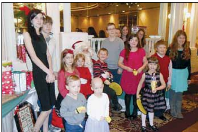
Young members gather around Santa.