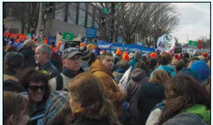
Some of the thousands of demonstrators at the peaceful March for Life rally.

See more photos of the event on the front cover of this issue.