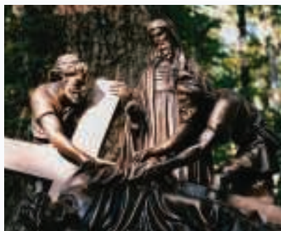
NINTH STATION Jesus falls the third time