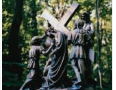
FIFTH STATION Simon of Cyrene helps Jesus to carry his cross