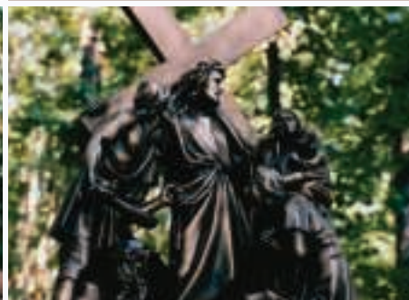
EIGHTH STATION The women of Jerusalem weep over Jesus