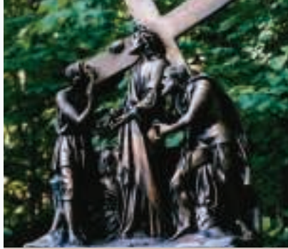
SECOND STATION Jesus is made to carry his cross