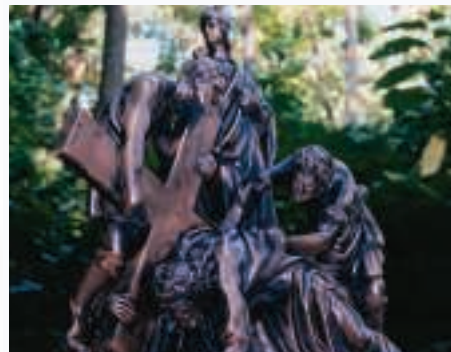
SEVENTH STATION Jesus falls the second time