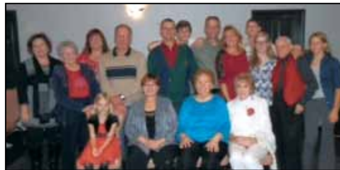
A group of members who attended the Pittsburgh District Christmas party.