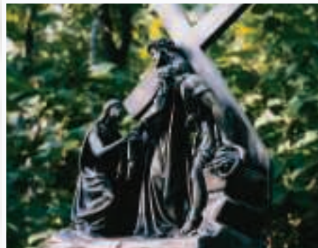
SIXTH STATION Veronica wipes the face of Jesus