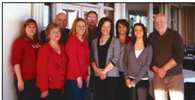
Members and guests at Branch 52's Christmas party.