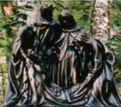
FOURTEENTH STATION Jesus is laid in the sepulcher