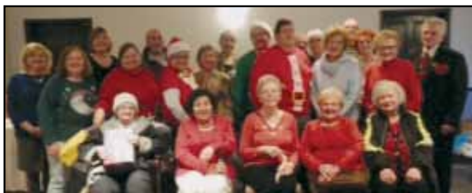
A group of members who attended the Pittsburgh District Christmas party.