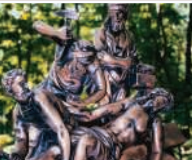
ELEVENTH STATION Jesus is nailed to the cross