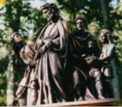
FIRST STATION Jesus is condemned to death