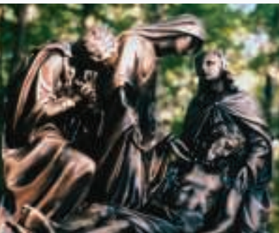
THIRTEENTH STATION Jesus is taken down from the cross and placed into the arms of his mother