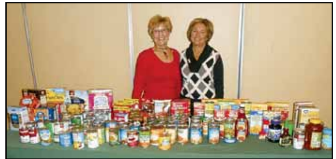
Canned goods and non-perishable food was collected for donation to a local food pantry.