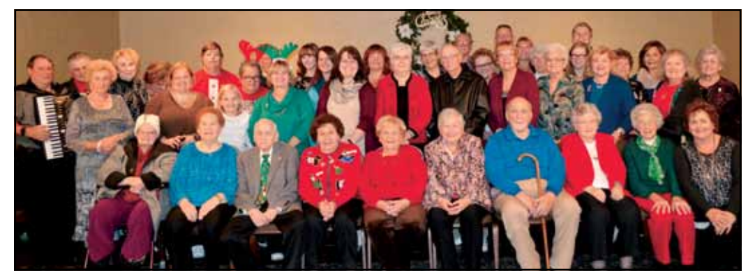
Members and guests of the Pittsburgh District gather for a photo at their annual Christmas party.