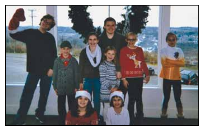
Young members who attended Branch 52's Christmas party at Grandview Golf Club.

Everyone enjoyed a memorable time and Branch members are looking forward with anticipation to another great LPSCU year for 2017.