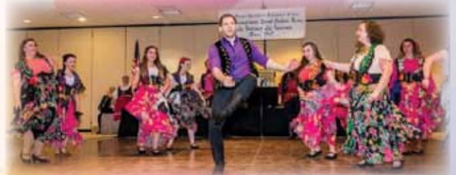
A dancer from The Pittsburgh Slovaks entertains the banquet crowd.