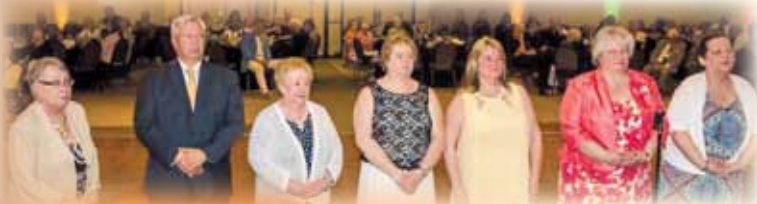
Members of the new LPSCU Board of Directors are sworn in at the Convention Banquet.