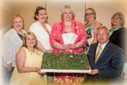
Winners of this year's Convention Campaign surround a clever Battle of Gettysburg-themed display.