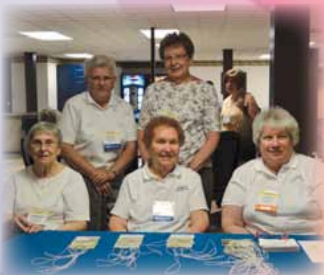
The efficient ladies who staffed the Registration Table.