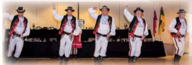
The Pittsburgh Slovaks men entertain with a lively folksong and dance.