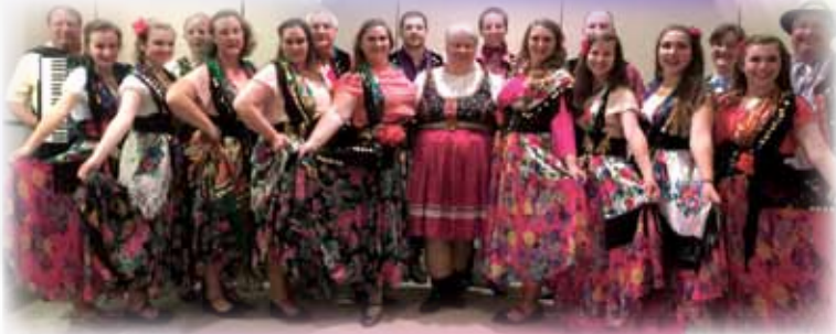
Banquet attendees were treated to a lively performance by The Pittsburgh Slovaks.