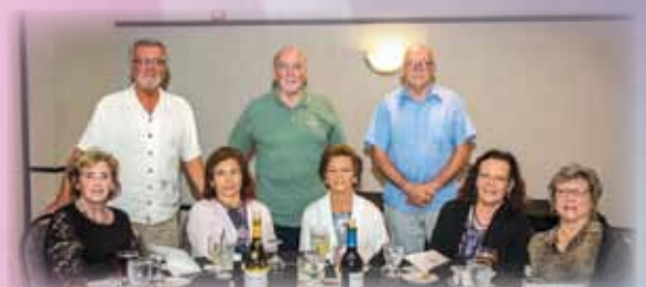
Members of the extended Tomasic family at the Convention banquet.