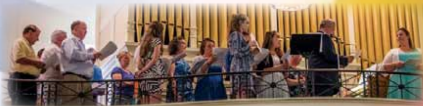
The Pittsburgh Slovaks served as the choir for the Convention Mass.