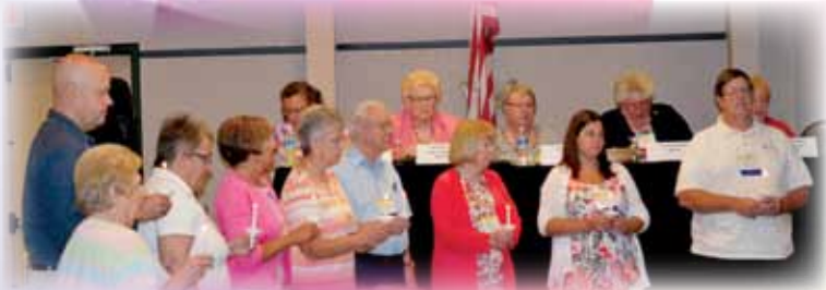
A Memorial Service was held on the first afternoon of the Convention.