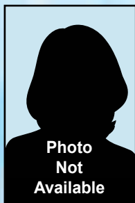
Photo Not Available