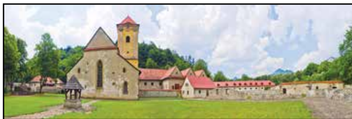
The monastery where Cyprian grew up.

The next day, he could not wait for the evening to come.