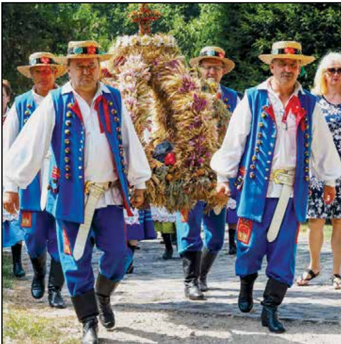
Dressed in native kroj , members of the procession carry a Slovak harvest wreath.