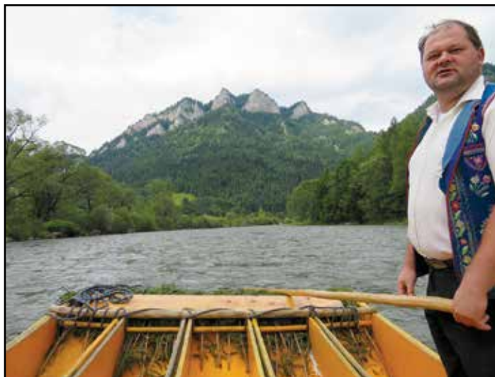
Tri Koruny Peak