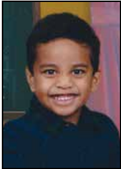
Samuel J. Frank Kindergarten St. Nick's/St. Mary's Wilkes-Barre, Pennsylvania Branch 213 Dallas, Pennsylvania