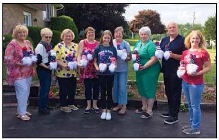
Branch 60 members and guests show off their patriotic gnomes.