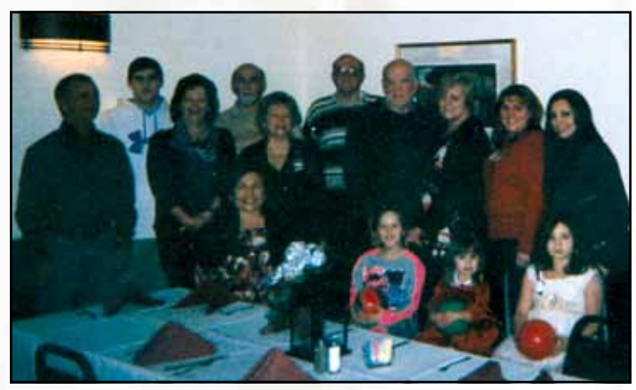
Some of the members of Branch 52 who braved the wintery weather to attend.

Everyone enjoyed a memorable time and Branch members are looking forward with anticipation to another great LPSCU year.