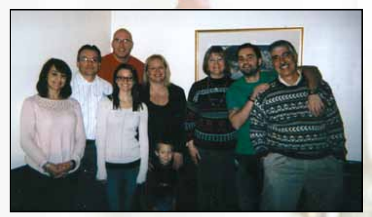
A group of Branch 52 members enjoying their annual Christmas party.