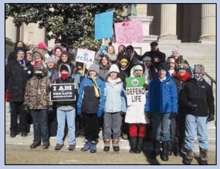
A group of students from Epiphany School in Sayre, Pennsylvania and Slovak fraternal members who braved the bitter cold to attend the March for Life on January 22, 2014.