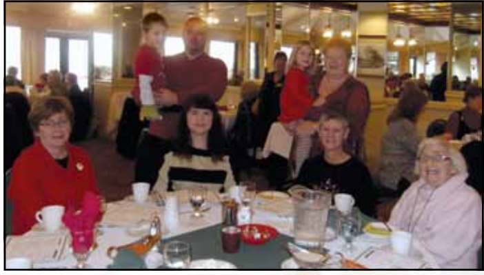
Members and guests enjoying the party.

Members and guests joined in the Matching Fund special gift raffle for the benefit of Candy's Place — The Center for Cancer Wellness in Forty-Fort, Pennsylvania. Canned goods