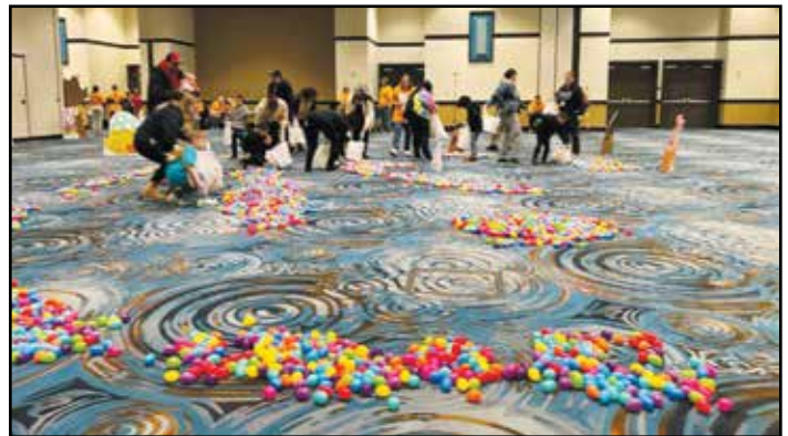
Look at all those eggs just waiting to be found!

It was such a wonderful day seeing the smiles on the faces of all the children and adults. In addition to its volunteer members, Branch 213 donated $200, with an additional $100 to be donated by the LPSCU Home Office through the Matching Fund Program.